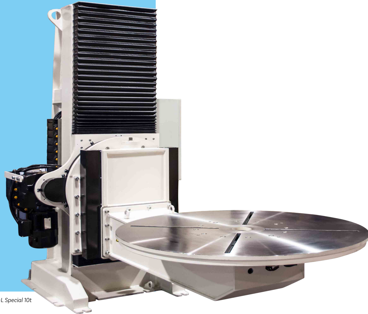
D-TLP-L Special 10t