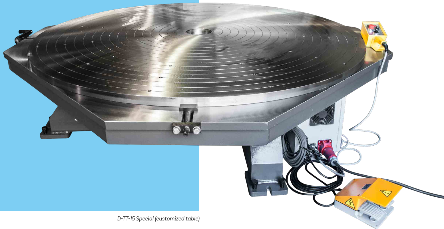
D-TT-15 Special (customized table)